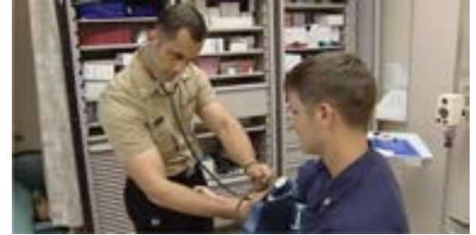
Client: U.S. Navy Medicine/BUMMED Project: "Navy Safe Harbor – Never Sail Alone" https://www.thevideosolution.com/safe-harbor