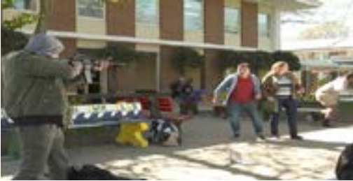
Client: George Mason University Project: "Active Threats - Awareness & Prevention" https://www.thevideosolution.com/active-threats