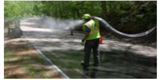
Client: Federal Highway Administration/ATSSA Project: "High Friction Surface Treatments" https://www.thevideosolution.com/hfst