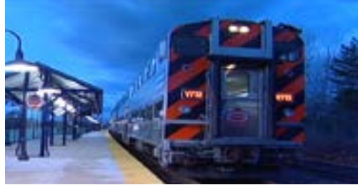
Client: Virginia Railway Express Project: "VRE – Emergency Preparedness Guidelines" https://www.thevideosolution.com/vre