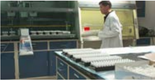
Client: Armed Forces Health Surveillance Center Project: "Inside the AFHSC" https://www.thevideosolution.com/afhsc